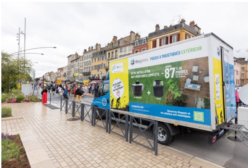
Biogents Podium Truck