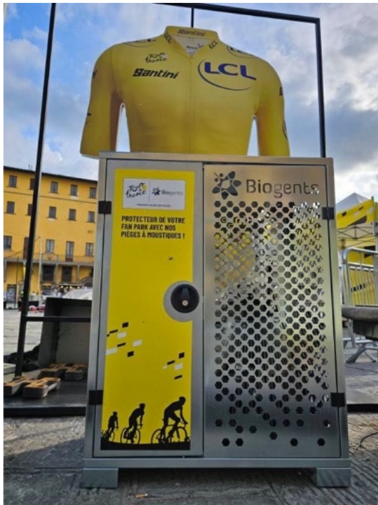
Protection of the Fan Park in Florence

You can follow Biogents news during the Tour de France on its LinkedIn account, as well as that of its distributors SBM Life Science and SPG .