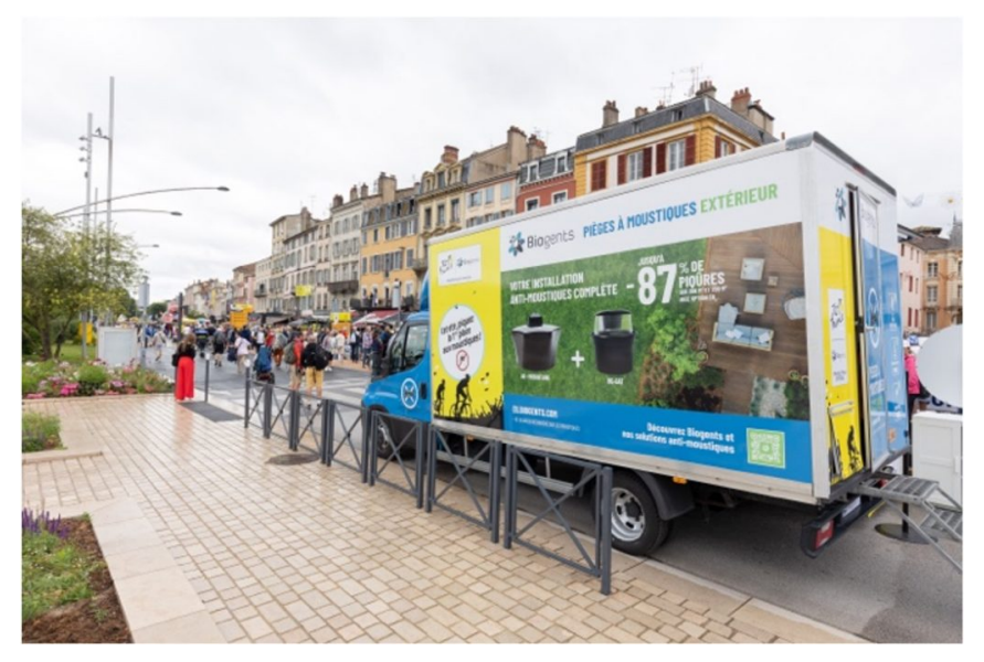
Biogents Podium Truck