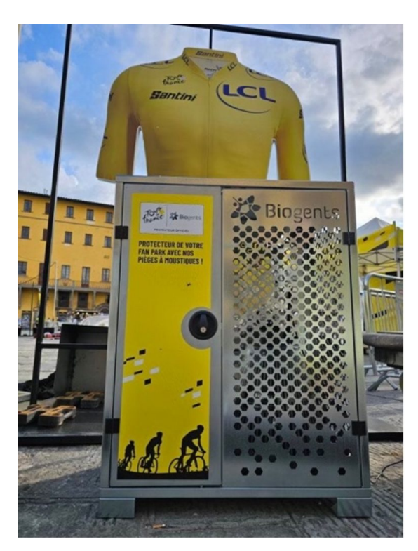
Protection of the Fan Park in Florence